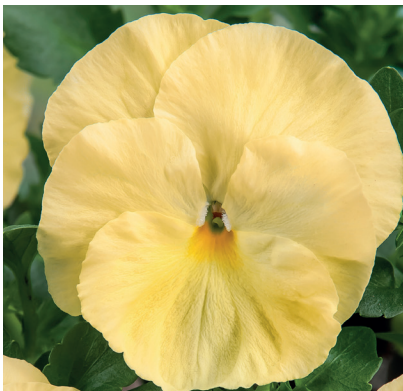
Xtrada™ Lemon Shades