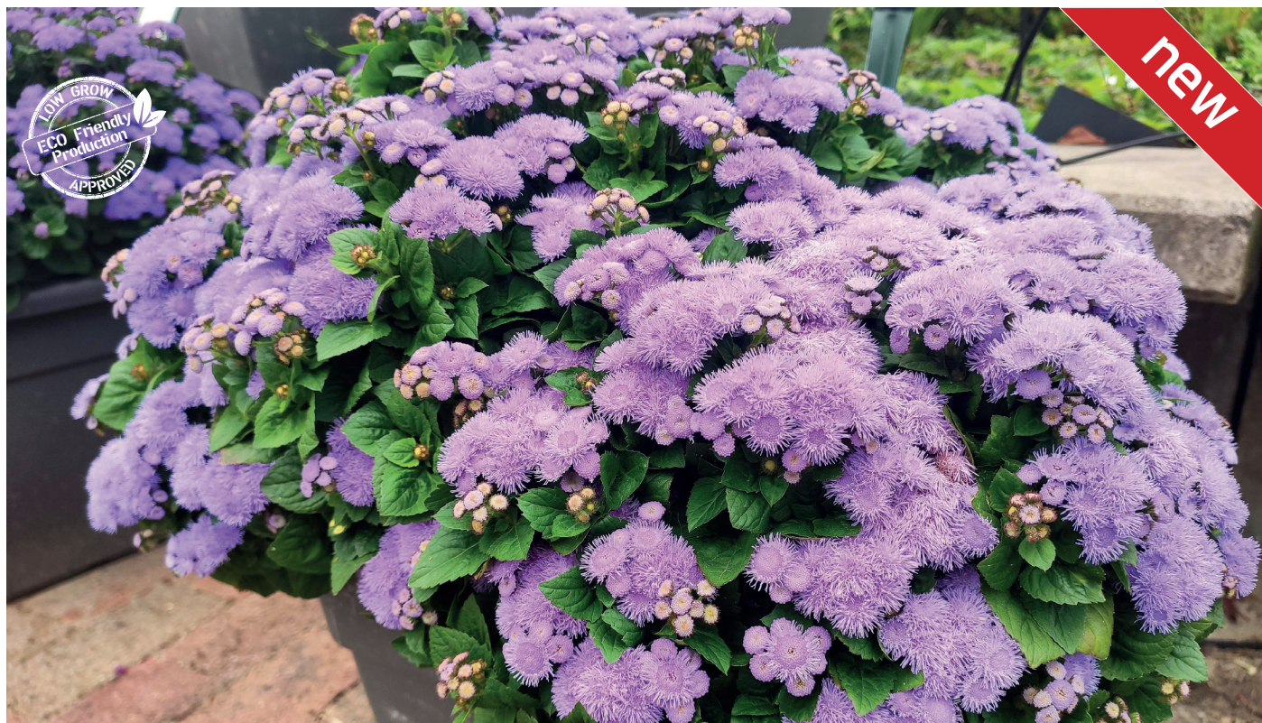
Kona Blue outdoor performance