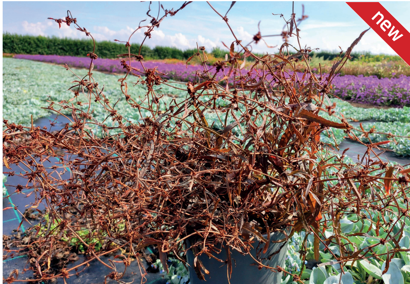
Twister Copper Red