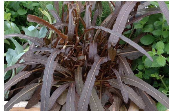
Twister Copper Red young stage