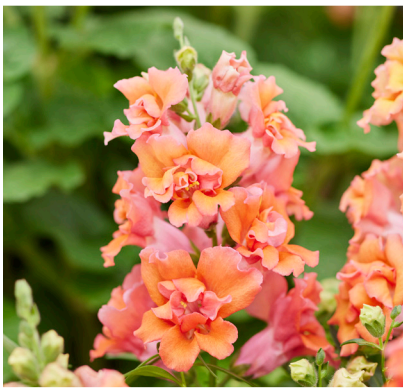
Twinny Bronze Shades