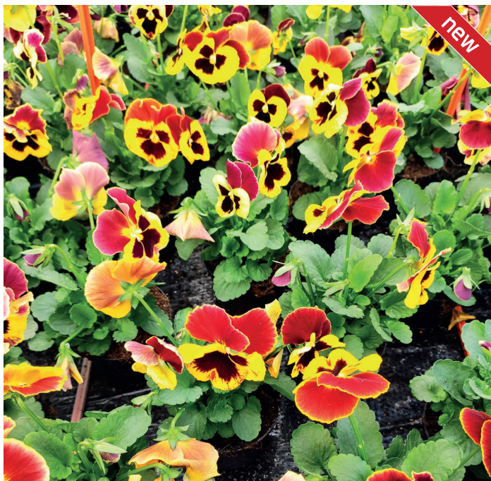
Cello Strawberry Vanilla