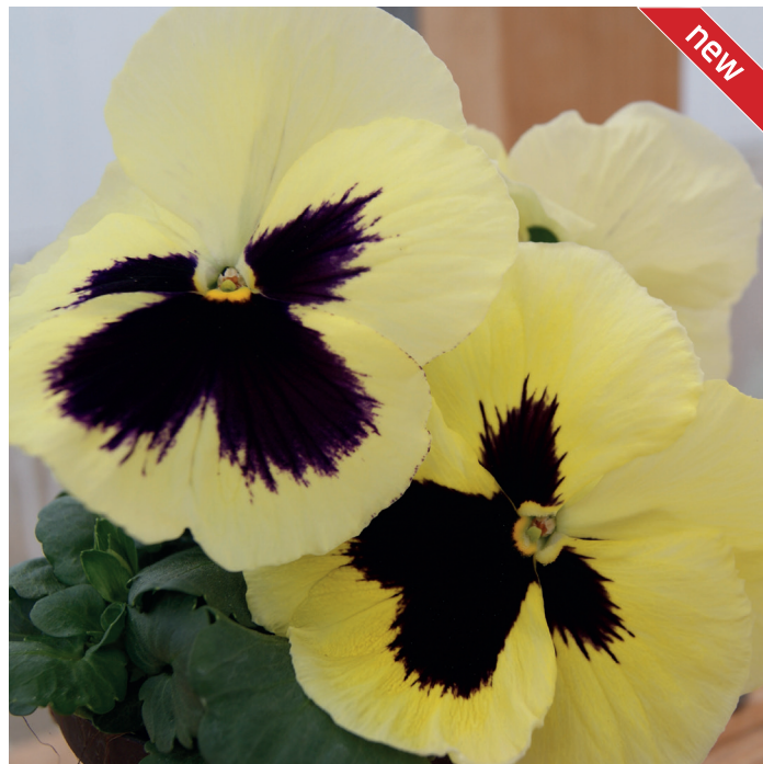
Xtrada™ Lemon Blotch