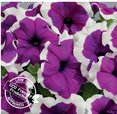
Limbo GP Violet Picotee