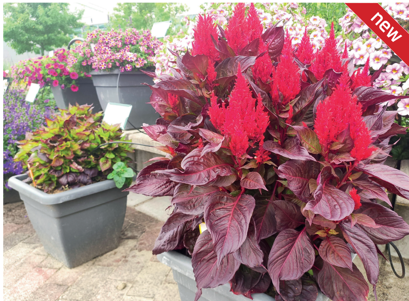
Arrabona™ Bronze Leafed Red