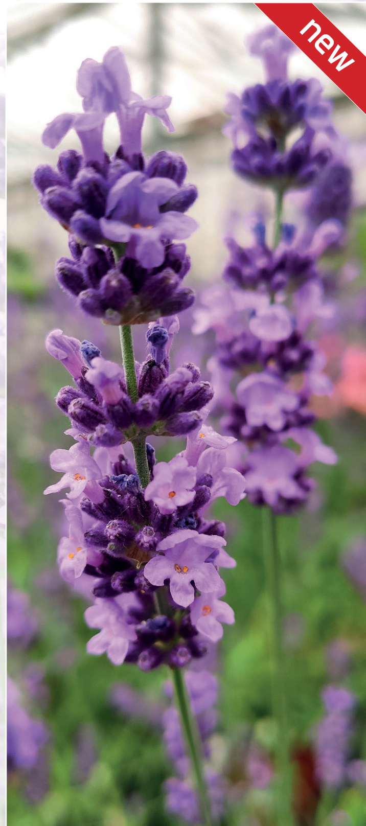
Lovely Sky Blue