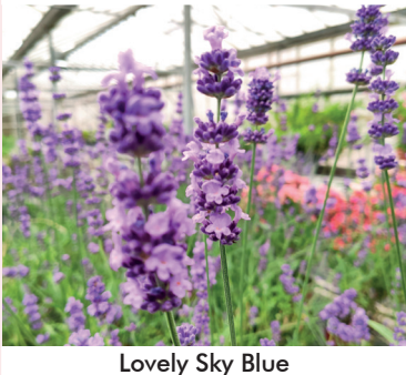
Lovely Sky Blue