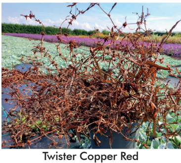
Twister Copper Red