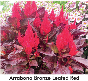
Arrabona Bronze Leafed Red