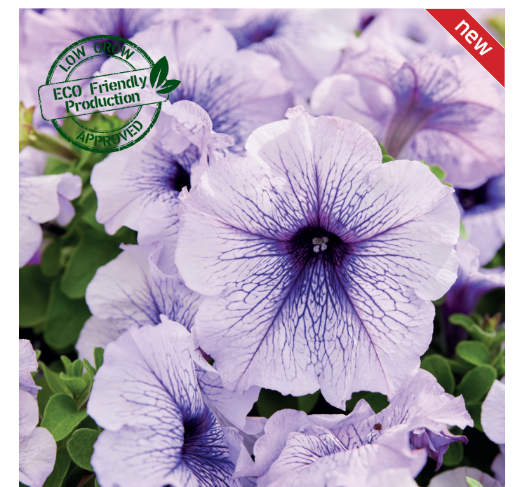
Mambo GP Silver Blue