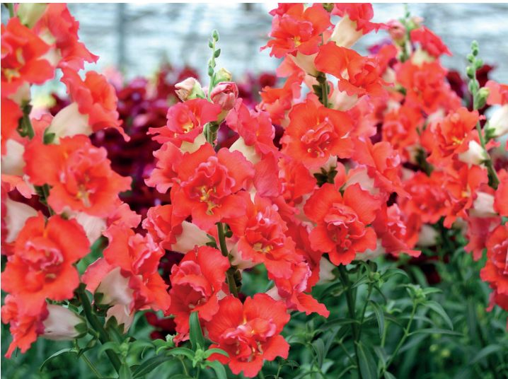
DoubleShot™ Orange Bicolor