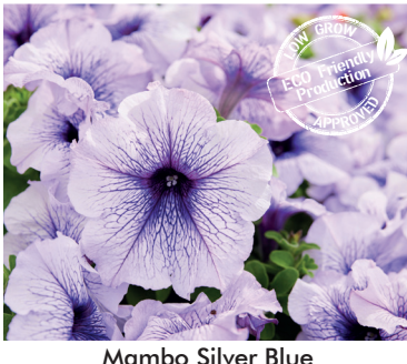
Mambo Silver Blue